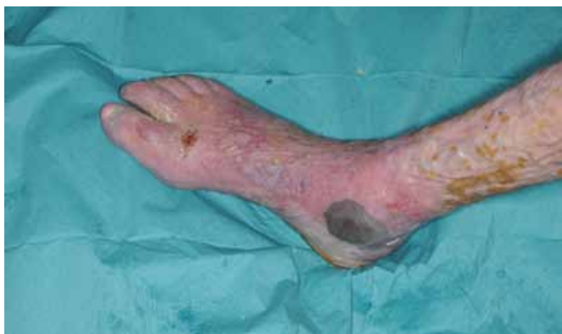
Figure 4. Case Study 3

To understand how wound infection results in excessive exudate it is necessary to describe the role of exudate in the normal healing process. A consistent factor for all chronic wounds is a prolonged inflammatory response (Moore, 1999), with cells associated with the inflammatory phase present in the wound exudate (Buchan et al, 1980). Inflammation leads to an increase in vasodilatation and vessel permeability. In this way, there is continual additional extracellular fluid formation and this usually results in an increased and prolonged production of wound fluid and exudate (Vowden and Vowden, 2003). If a wound infection develops from colonization with pathogenic bacteria, the exudative