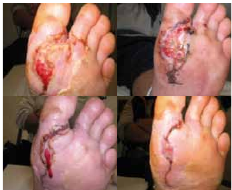
Figure 3. Case study 2