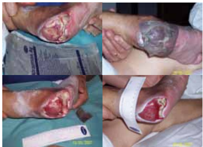
Figure 2. Case study 1

This was a 47 year old gentleman who had Type 1 diabetes. He was a builder by trade and had developed the wound to his foot by wearing incorrect footwear (Figure 3). As he had peripheral neuropathy, he only became aware of the wound when an unpleasant odour had developed. On initial assessment, the wound measured 5 x 3 cm and the wound bed consisted of 70% slough and 30% granulation tissue. The skin surrounding the wound was healthy and intact; however, the wound was producing heavy, purulent exudate. Infection by Methicillin-resistant Staphylococcus aureus was confirmed by wound swab. Atrauman® Ag together with a foam dressing was used for 20 days. After